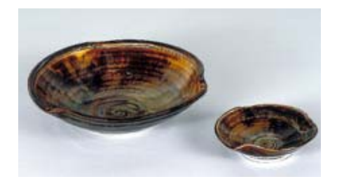
Sue Griese Pottery Sale Nov. 19, 20, 21 Fri. 5-10pm

Sat. and Sun. 11am-6pm The Edge Amenity Building (Pottery Studio Downstairs) 289 Alexander St. (at Gore Ave. in Vancouver) You will enter through the south parking garage door on Gore Ave. (end of Railway St.) This is part of The Eastside Cultural Crawl. I will have Functional cone 6 porcelain, stoneware and earthenware pot-