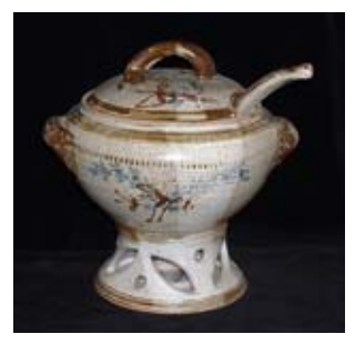
Annual Christmas Pottery Show and Sale

(as usual, 10% off regular prices) and Nobody's Perfect Pottery 'seconds' Friday November 26 and Saturday November 27, 2004 10:00 am to 5:00 pm 9002 Chemainus Road (2 miles south of Chemainus)