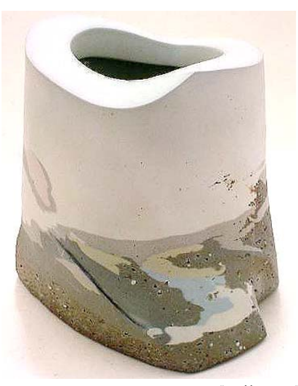
"Double Morain" 22x19cm

For more information, see ad on page 9.