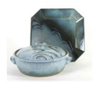
Creek Clayworks Christmas Pottery Sale And Studio Open House

Sat. & Sun, Nov. 20 and 21, 10:00 a.m. - 5:00 p.m. 1738 Lockyer Rd., Roberts Creek on the Sunshine Coast We hope you will join us for lots of pottery and tasty goodies. 604-885-2395