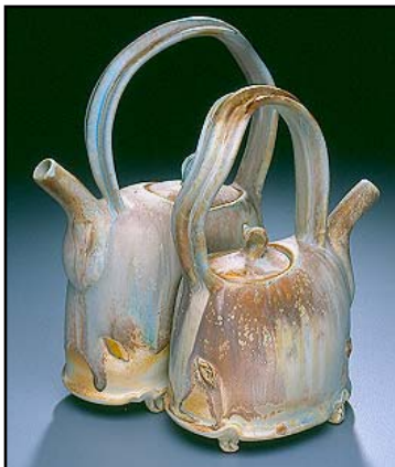
Meira Mathison "Nestled T-Pot With Hot Water Pot" See "Fired Up" on page 10