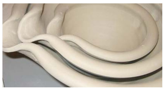
Bowls from The Chris Staley Workshop. See page 2 for story.

Maple Ridge Art Gallery, 11944 Haney Place, Maple Ridge 604 467 5855