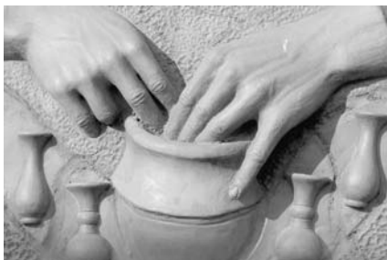
Potters Mural, Cappadocia, Turkey

This is an industry standard policy and we've had to learn the hard way that this is also the best policy. Thank you for your understanding.