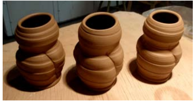
Freshly-thrown bird bodies.

For more of her work see: www.gillianmcmillan.com