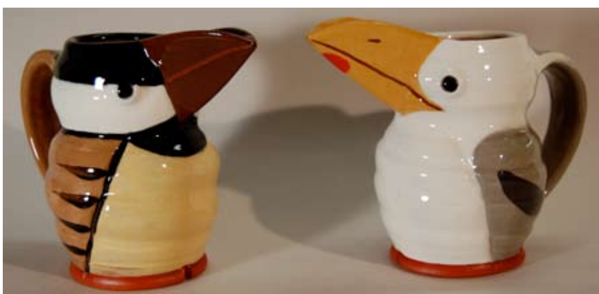
Top: Painted with slip and drying. Above (L to R): Finished chickadee and seagull birdjugs.

Greenbarn's catalogue is now available online.