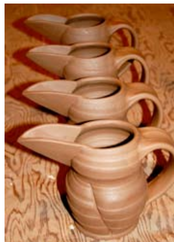
Beaks and handles attached.