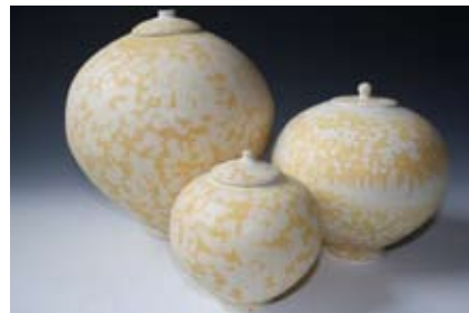
Yellow matt crystal pots, by Trezlie Brooks.

The focus of my work revolves around our daily human rituals. I would like each vessel to evoke a memory of friendship, comfort, beauty or family. Each piece has its own form and function and should be used and handled daily. I love that people have intimate relationships with my pottery: plates used for family dinners, tea pots part of a conversation between friends, or the simple mug caressed during a stroll through the garden. Unique