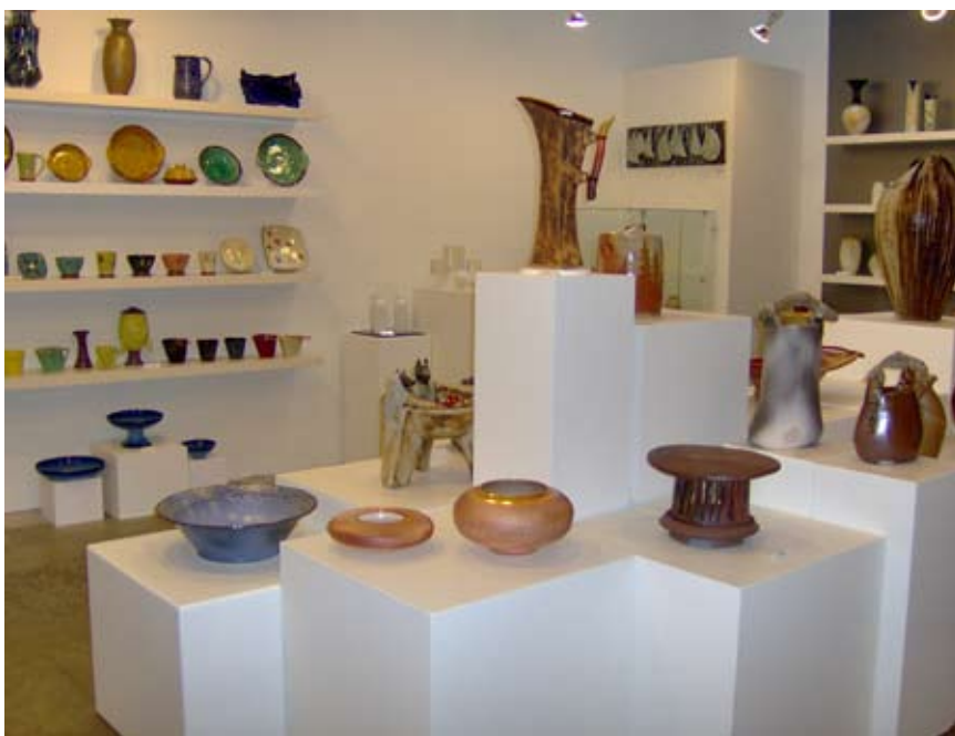
A feature area for larger pieces.

I'll err on the side of optimism here and assume that many guild members already have