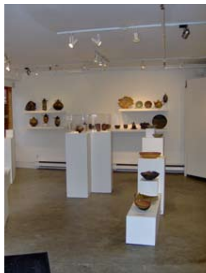
The exhibition space is currently allocated to various artists.