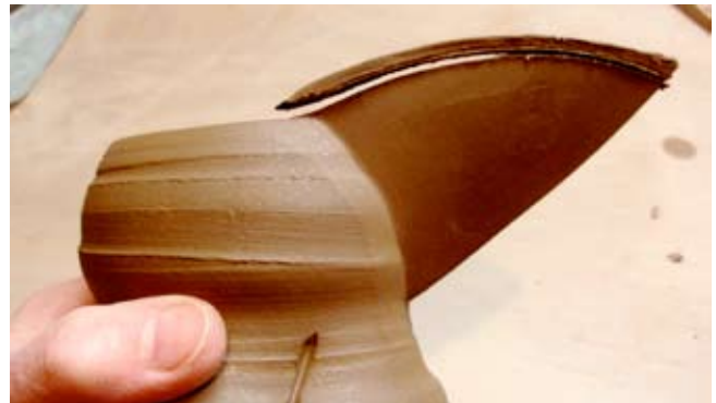
Refining the shape.