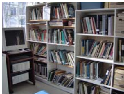
Well-organized shelves of the guild library, located above the Gallery of BC Ceramics.

The PGBC is a volunteer organization that thrives on the input of its volunteers. There are many interesting ways to get involved. Here is a brief account of one group of stalwarts who really helped us out, and we thank them very much for their time, interest and much-appreciated organizational skills!