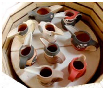
Top: Next day, eyes and latex resist are added, and then they're dipped in slip. Above: Bisqued birds.