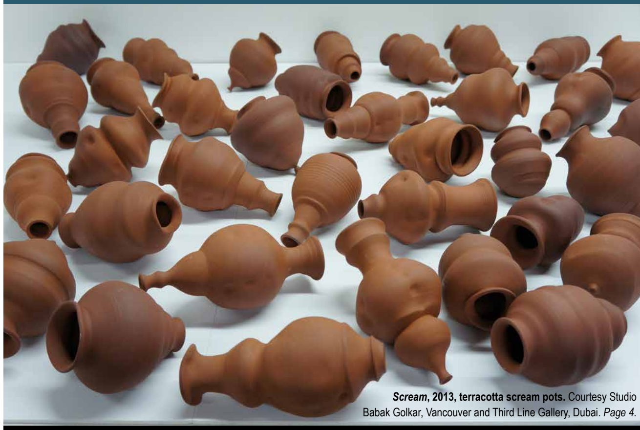
Scream, 2013, terracotta scream pots. Page 4.