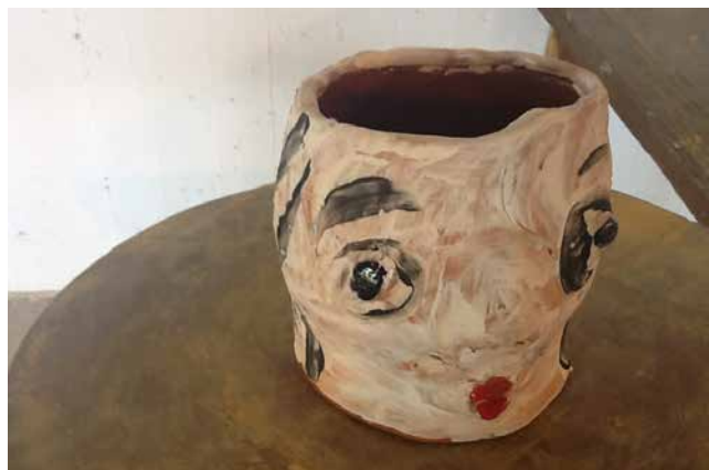
One of Dona's pieces from the Skopelos workshop.

On Skopelos, the group turned out to be an incredible bunch of people, ages 20 to 87 years...and I think the most notable thing was they had never met an artist like Suzy before. Suddenly they were given permission to be free...there were no hierarchies due to experience, no struggles between "craft" and "art", no limitations on what was deemed important, and no fear of digging down deep and expressing