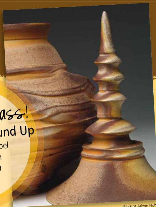
Work of Arlynn Nobel

Featured class! From the Ground Up Instructor: Arlynn Nobel Mondays, 10am-1pm January 13-March 10 Barcode 305973