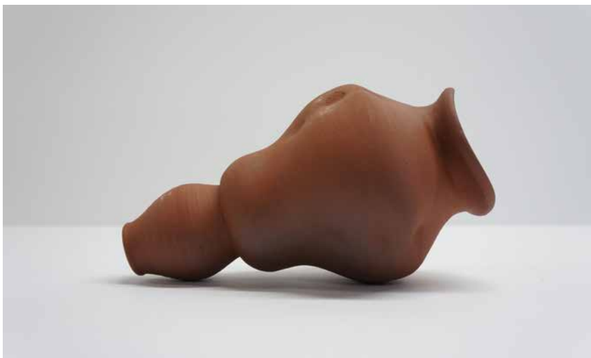
Scream (detail), 2013, terracotta scream pot, by Babak Golkar.

In one component of the exhibit, Golkar presents 30 terracotta "scream pots." Resembling organs, these participatory works