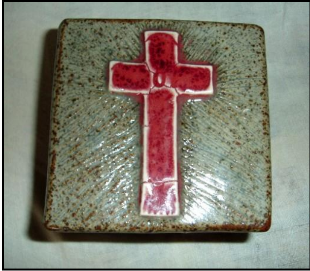
The POPE's Condom Box